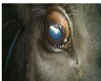
Figure 2; corneal opacity in newborn calf (2 days).