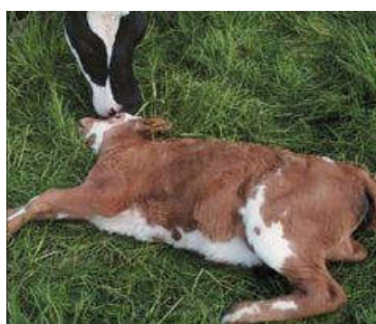
Figure 1; Lateral recumbence of 4 days calf infected with theileria parasites.