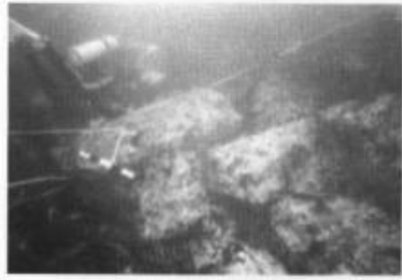
Figure 4. Scattered stone blocks.