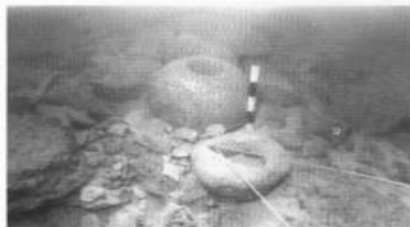
Figure 7. Ringstone anchors.