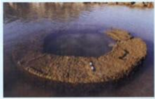
Figure 2. A circular stone structure exposed during low tide off Dwarka.