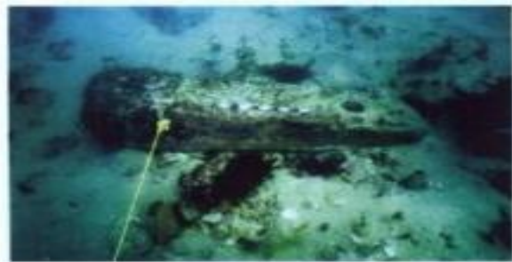
Figure 6. Grapnel or Indo-Arab type anchor.