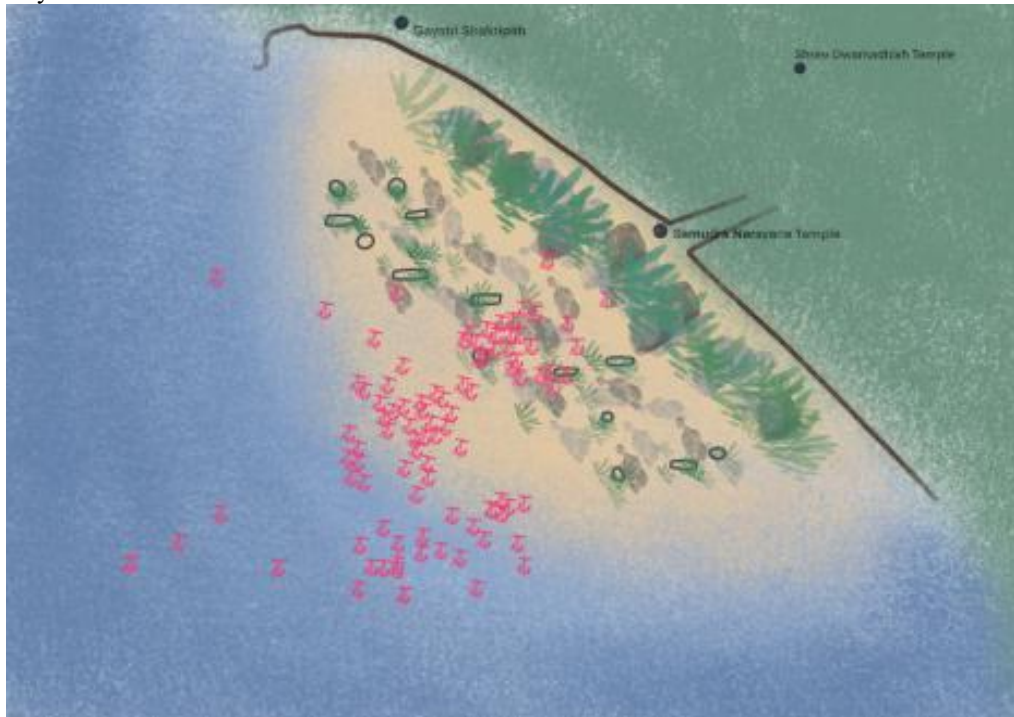
A visual representation of the existing structures discovered in Dwarka.