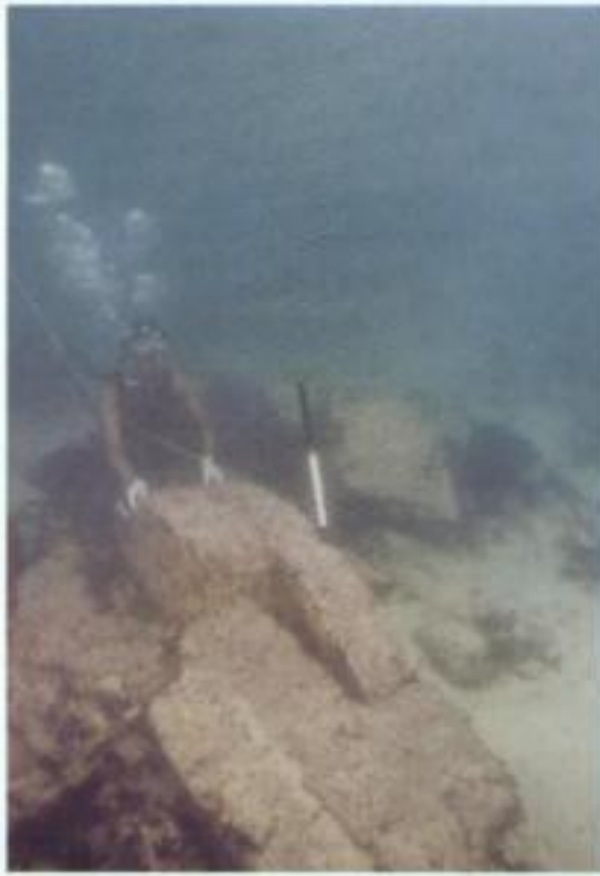
Figure 3. Stone blocks with L-shape cut.